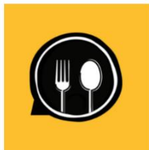
Friday Night Dinner