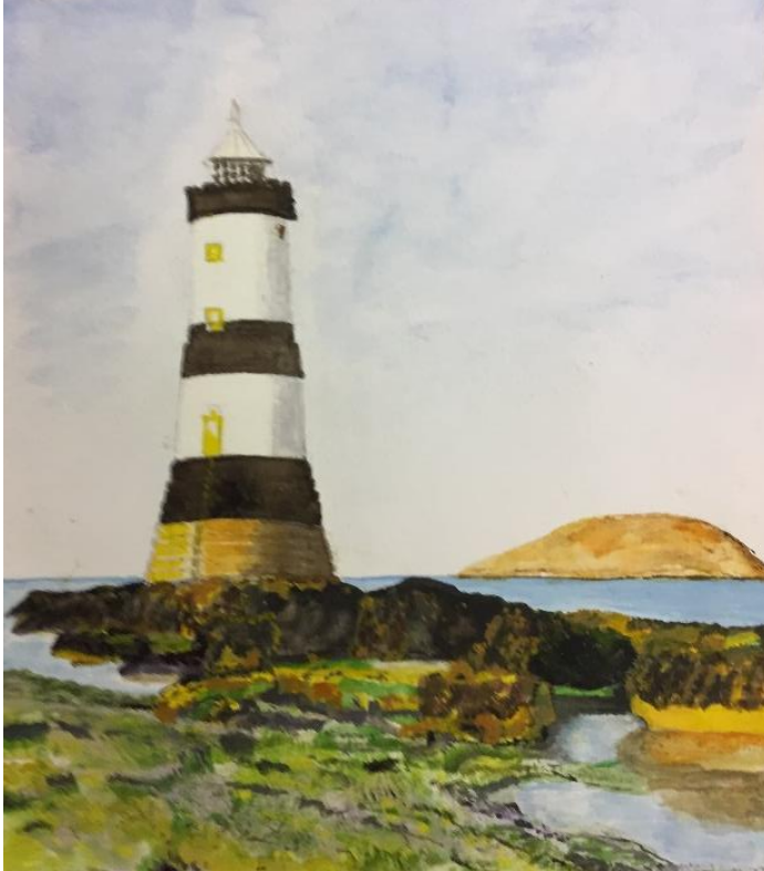
Illustration by a Friday Art Group member